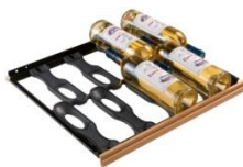
Sliding shelf ACMSC