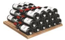
Storage shelf AXUH