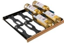
Sliding shelf ACMSC