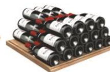
Storage shelf AXUH